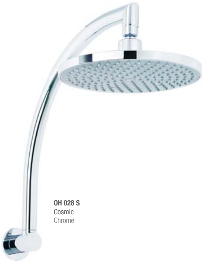
OH 028 S Cosmic Chrome