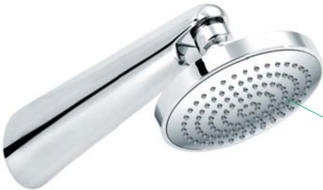
OH 008 G Streamjet XL Chrome

Streamjet XL Shower Face with Easy Clean Nozzles