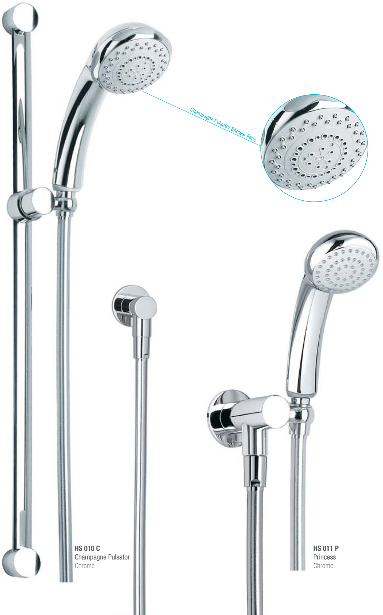
HS 010 C Champagne Pulsator Chrome