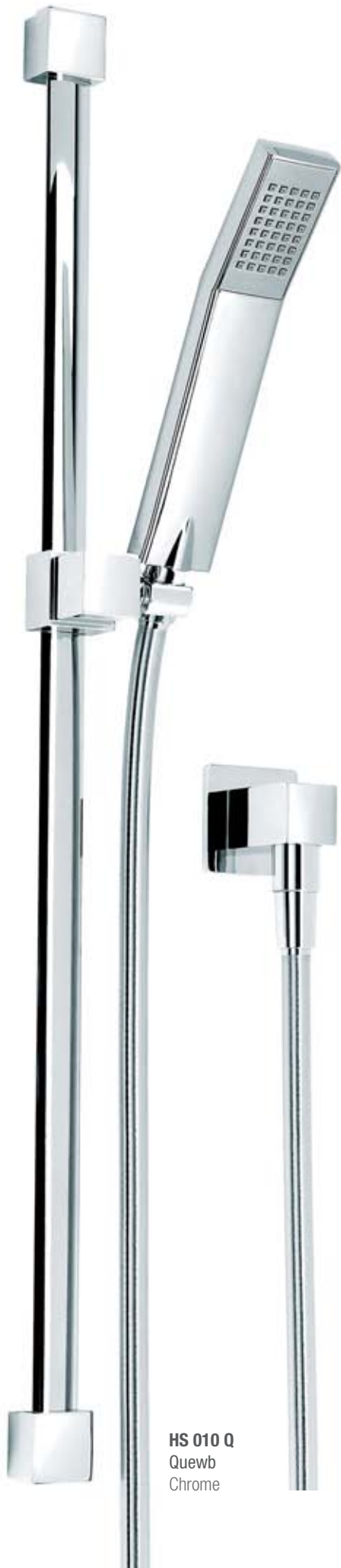
HS 010 Q Quewb Chrome