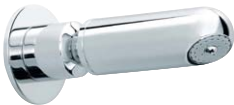
CS 008 Pioneer Chrome