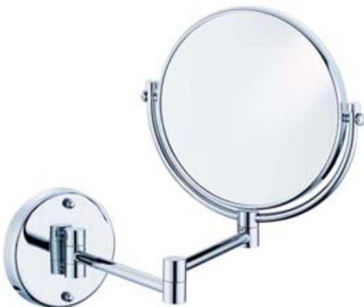
BA 780 - Dual Sided Mirror Normal and 3x Magnification Chrome