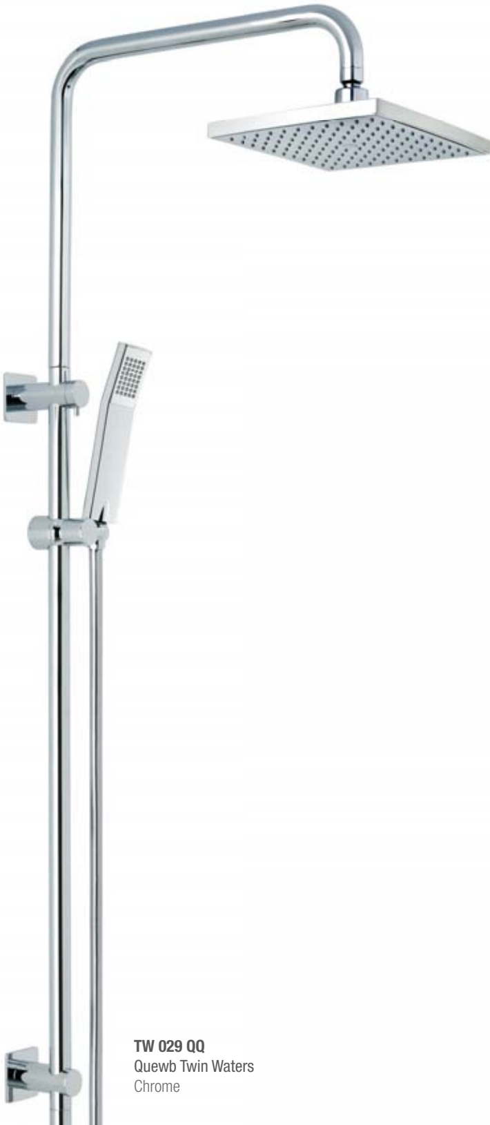
TW 029 QQ Quewb Twin Waters Chrome