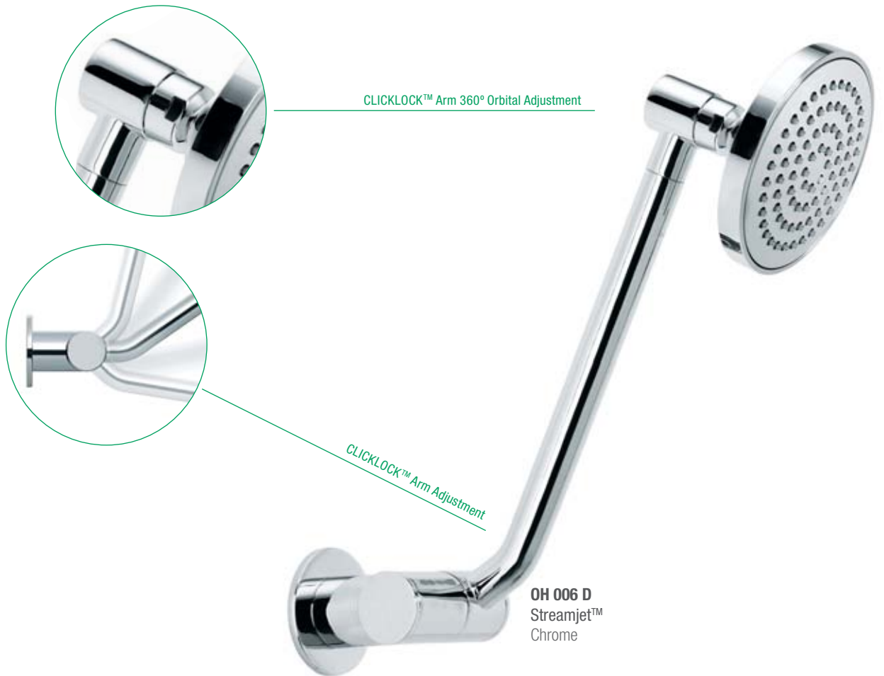
OH 006 D Streamjet™ Chrome