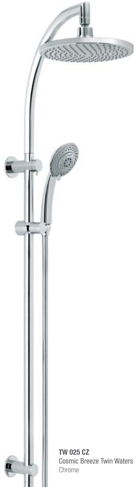
TW 025 CZ Cosmic Breeze Twin Waters Chrome