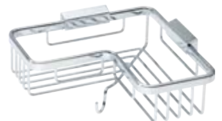
WB 006 Corner Basket With Hook Chrome