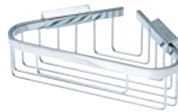
WB 009 Corner Basket Small Chrome