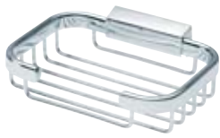
WB 005 Open Front Rectangular Basket Small Chrome