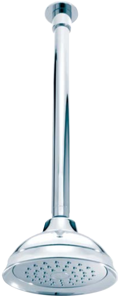
OH 005 V Chrome