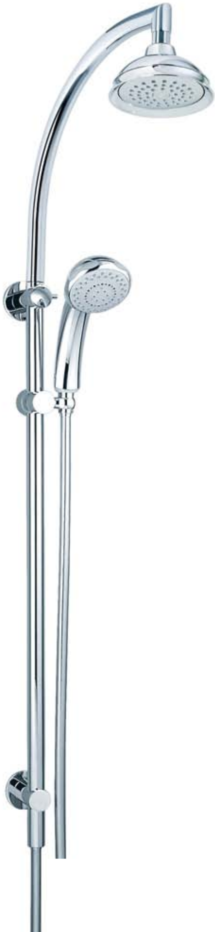
TW 025 PC Champagne Pulsator and Paddington Chrome