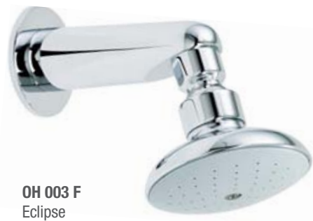
OH 003 F Eclipse Chrome