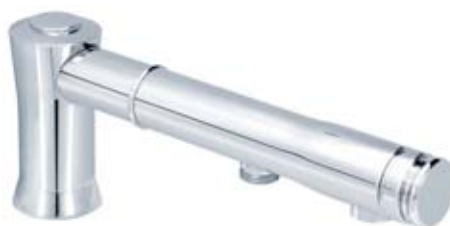
DV 067 - Hob Mount Long-Reach Bath Diverter 205 mm Chrome