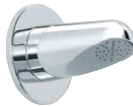
CS 009 Vanguard Chrome

A unique addition to the Con-Serv range of overhead showers are the vandal and tamper proof showers shown below. Each one is designed to enhance the safety and security of any bathroom. All vandal and tamper proof showers are 3 Star - 9 L/min rated as per WELS licence number 0046.