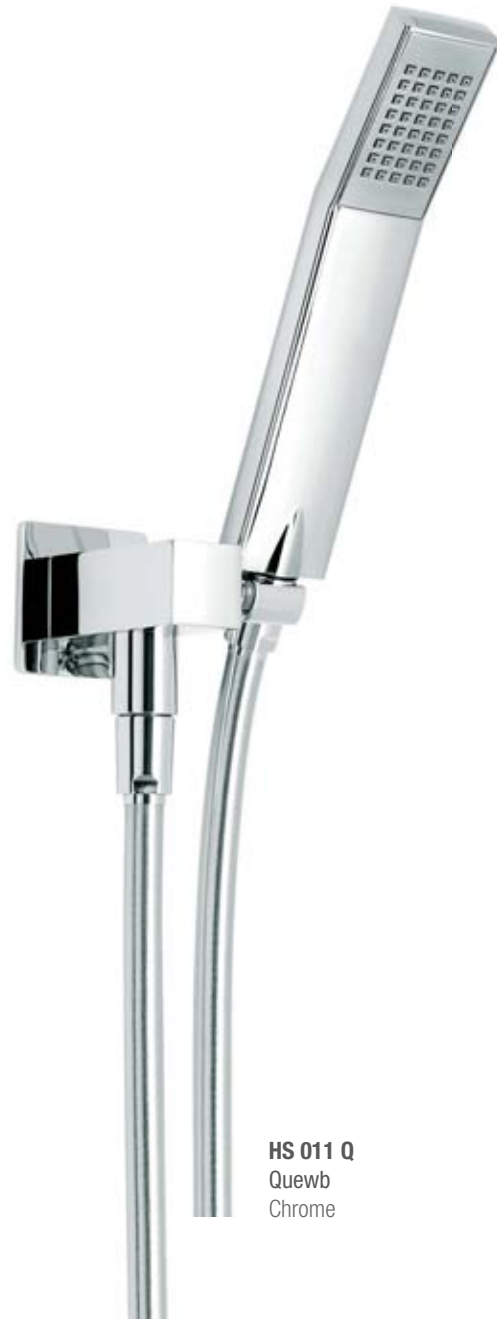
HS 011 Q Quewb Chrome

The Quewb shower range takes the square look to the next dimension, combining minimalist beauty and bold square edge profiles utilizing the best in water conservation technology. Select from the various overhead, handheld and rail options available to create your personalised showering environment. The Quewb offers a full body spray and is 3 Star - 9 L/min and 2 Star - 12 L/min rated as per WELS licence number 0046.