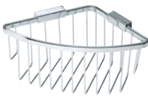
WB 007 Corner Basket Large Chrome