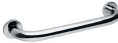
CR 300 - Comfort Rail 300 mm CR 450 - Comfort Rail 450 mm CR 600 - Comfort Rail 600 mm CR 900 - Comfort Rail 900 mm CR 1200 - Comfort Rail 1200 mm All measurements above are Ø to Ø. Polish Supreme