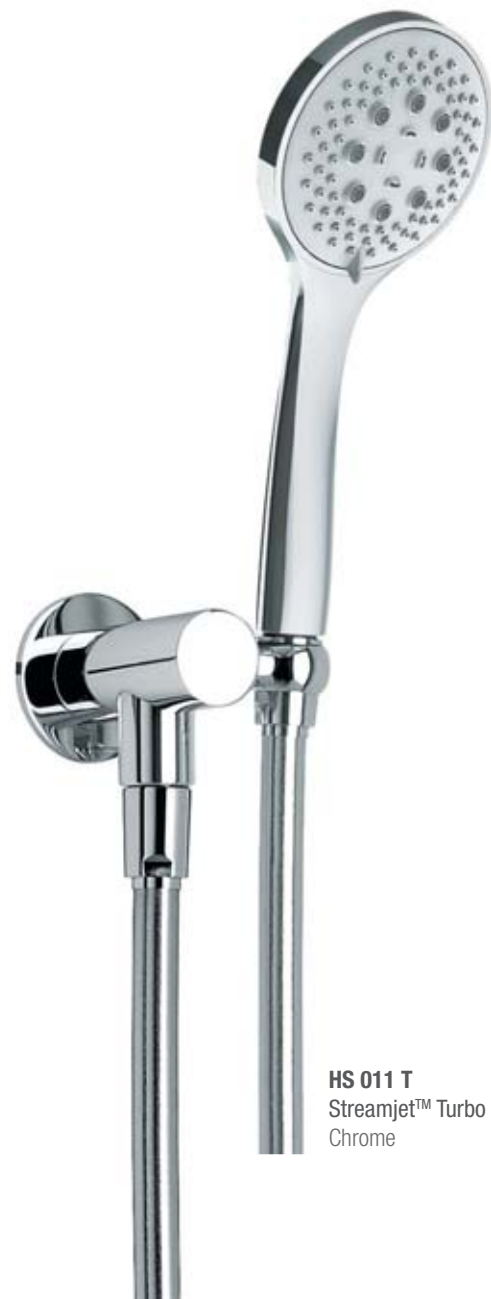
HS 011 T Streamjet™ Turbo Pulsator Chrome