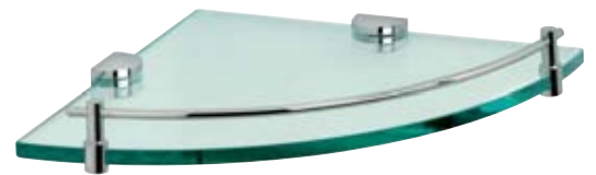
BA 739 10 mm Corner Glass Shelf with Barrier Chrome