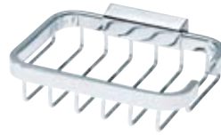
WB 003 Rectangular Basket Small Chrome