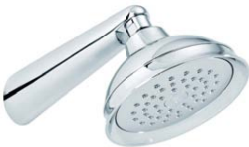
OH 005 G Chrome