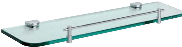
BA 729 10 mm Glass Shelf with Barrier Chrome