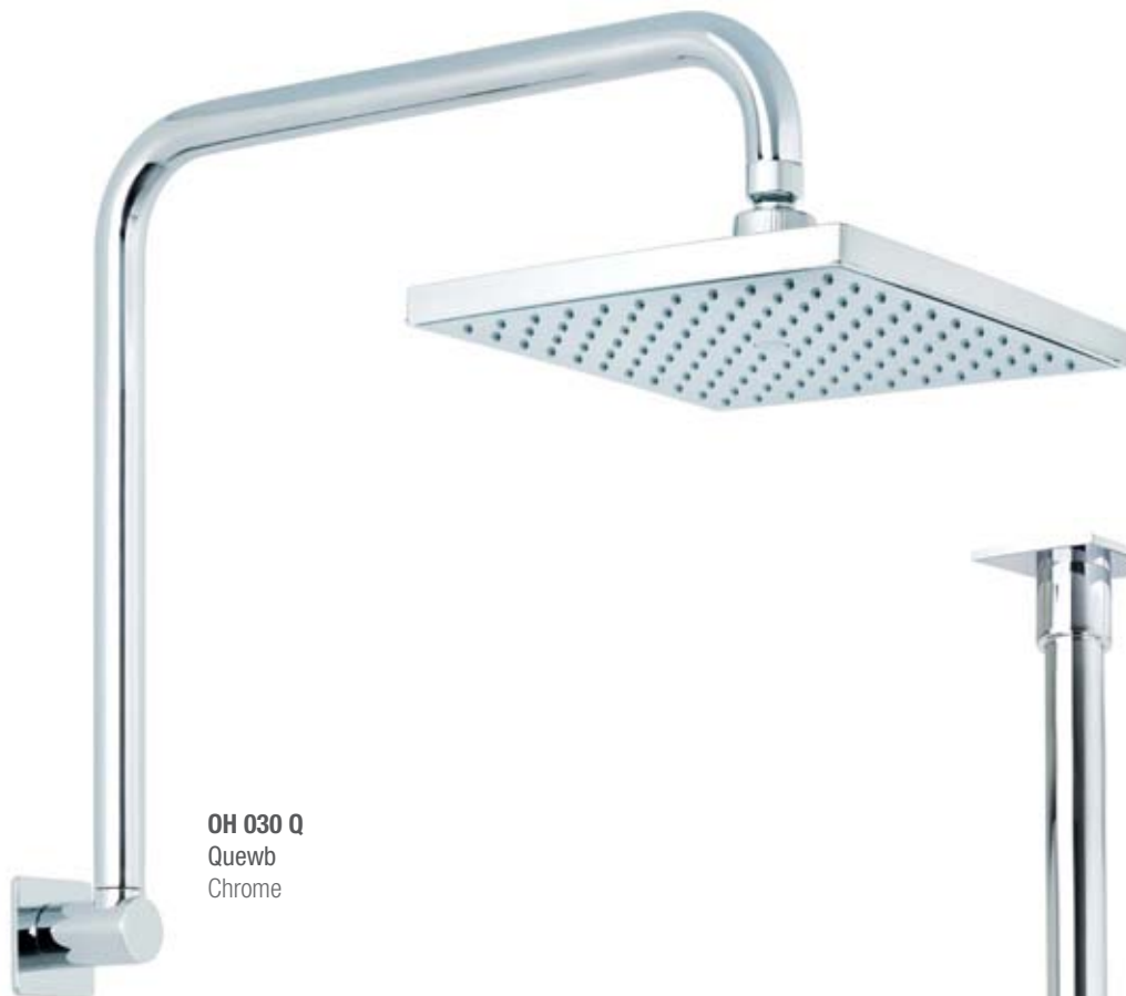
OH 030 Q Quewb Chrome