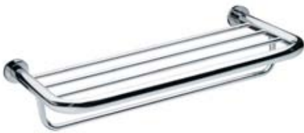
CR 022 - Bath Towel Shelf 600 mm Ø to Ø Chrome