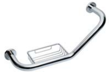
CR 036 - Ramped Comfort Rail with Soap Basket Chrome Suitable for either left or right hand installation.