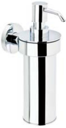
BA 742 - Wall Mounted Liquid Soap Dispenser Chrome