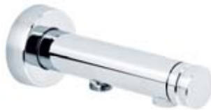
DV 068 - Long-Reach Bath Diverter 145 mm Chrome

Create a bath and shower combination to suit any bath or spa application with Con-Serv diverter bath combinations. Install a diverter spout, slide rail or hob mounted shower combination for water directional control. Con-Serv diverters feature a minimalist design offering dual function button control and are equipped with a bubble aerator outlet. Select your handpiece from our Breeze Pulsator, Champagne Pulsator, Heritage, Streamjet™, Streamjet XL, Streamjet Turbo or Princess handheld showers which are all 3 Star - 9 L/min rated as per WELS licence number 0046.