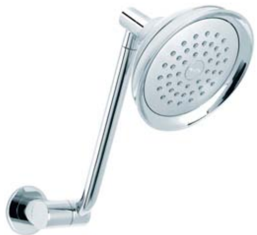
OH 005 D Chrome