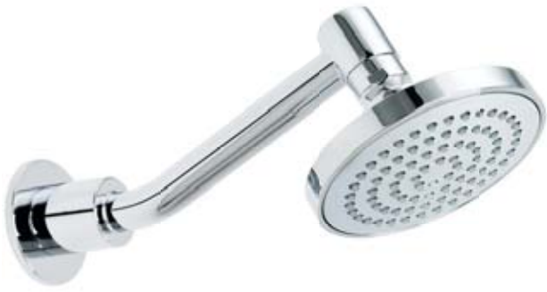
OH 006 B Streamjet™ Chrome

Con-Serv has perfected water saving technology to provide you with its diverse collection of overhead showers. From trendy minimalist designs to vandal proof functionality the range offers an extensive selection of arms. The CLICKLOCK™ arm as shown on page 17 was developed from Con-Serv's unique adjustment technology to ensure the stable positioning of your shower. Select your overhead shower from Breeze Pulsator, Streamjet™, Streamjet XL, Zodiac, Grenada or Eclipse which are all 3 Star - 9 L/min rated as per WELS licence number 0046.