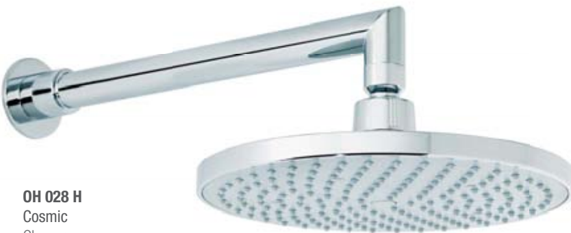
OH 028 H Cosmic Chrome