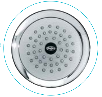
Paddington Shower Face