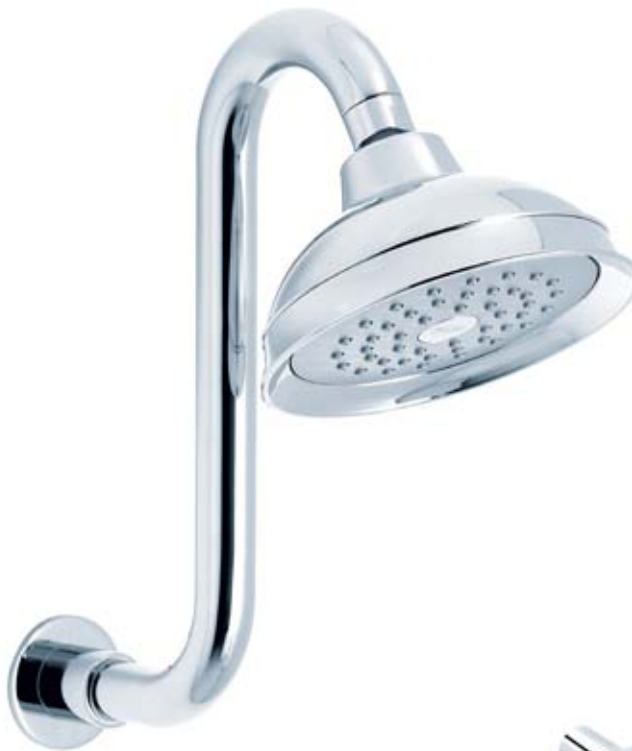
OH 005 E Chrome