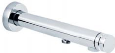
DV 069 - Extended Long-Reach Bath Diverter 215 mm Chrome