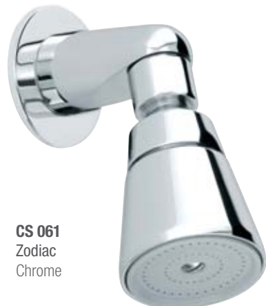
CS 061 Zodiac Chrome