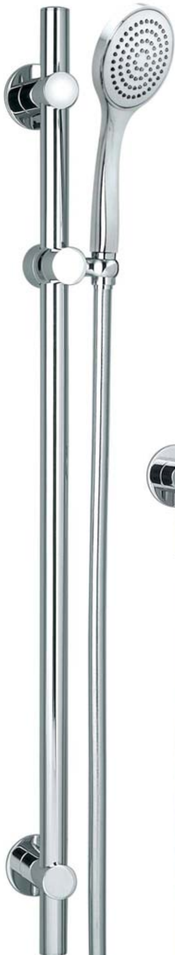
HS 020 J Streamjet™ Chrome

Mix and match Con-Serv showering components to create your customised showering environment. Choose from slide rails with easy to adjust friction sliders that accommodate various heights to wall mounting brackets that provide dual check back flow prevention. Select your handpiece from our Breeze Pulsator, Champagne Pulsator, Heritage, Streamjet™, Streamjet XL, Streamjet Turbo or Princess handheld showers which are all 3 Star - 9 L/min rated as per WELS licence number 0046.