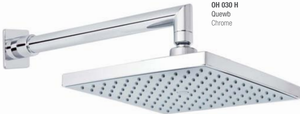
OH 030 H Quewb Chrome