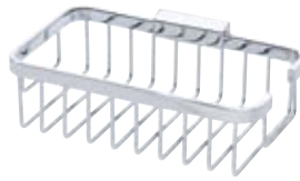
WB 002 Rectangular Basket Medium Chrome