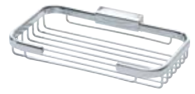
WB 004 Open Front Rectangular Basket Medium Chrome