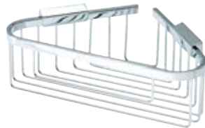
WB 008 Corner Basket Medium Chrome