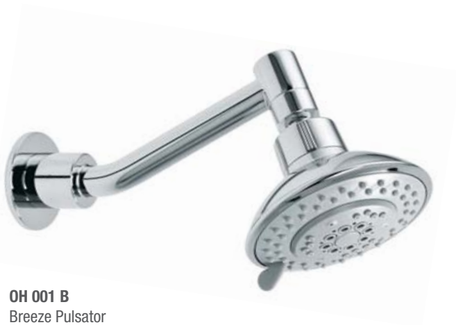
OH 001 B Breeze Pulsator Chrome