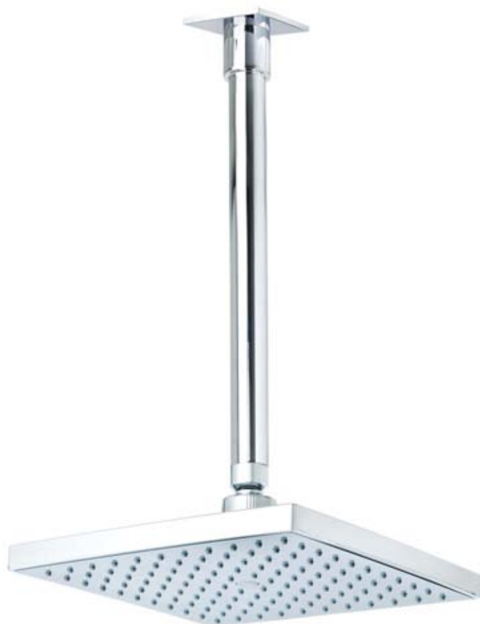
OH 030 V Quewb Chrome