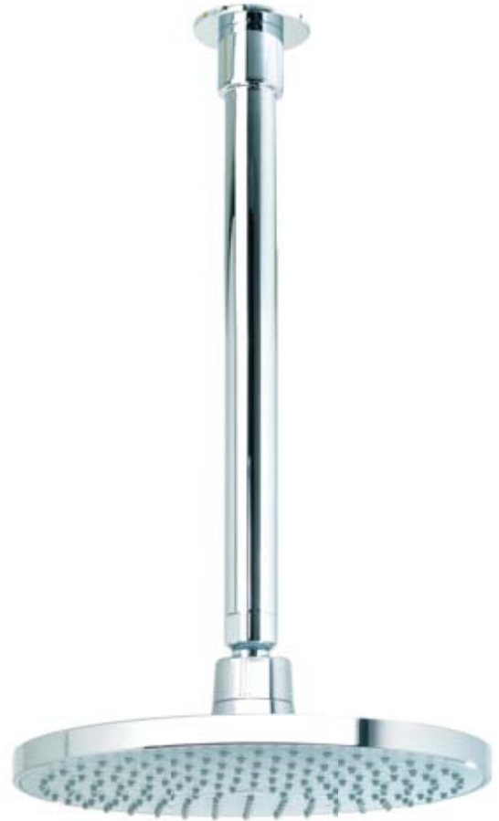
OH 028 V Cosmic Chrome